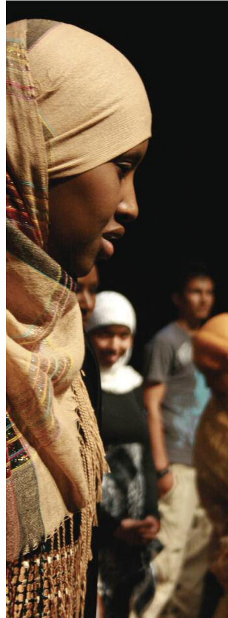
Refugee Week performance