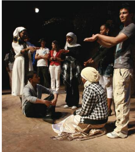
Minding the Gap performance

The Tricycle's Social Inclusion Programme provides arts-based activities for children and young people who are at risk of, or already experiencing, social exclusion. Most projects are delivered free at the Tricycle and off-site in the local community. The programme targets: young people who are newly arrived to the UK; young people permanently excluded, or at risk of permanent exclusion, from mainstream education; young people living in areas with high levels of crime; young people experiencing economic deprivation; young people from the Traveller community; and young people with special educational needs.