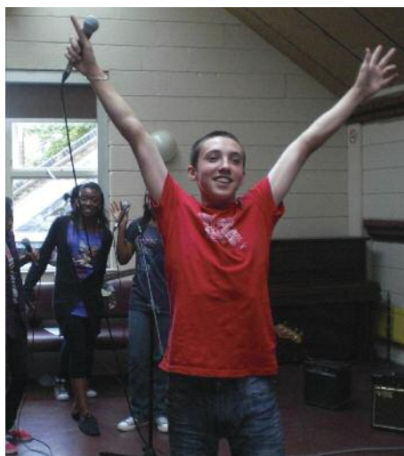
The Tricycle School of Rock summer workshop

The Tricycle Theatre has continued its partnership with Brent Citizens Advice Bureau, working together on a project called The Flip Side of The Coin , to tackle debt-related poverty among young adults. More than 15 groups (approximately 2,000 young people) in Brent received a live performance of a short play, followed by a structured workshop discussion.