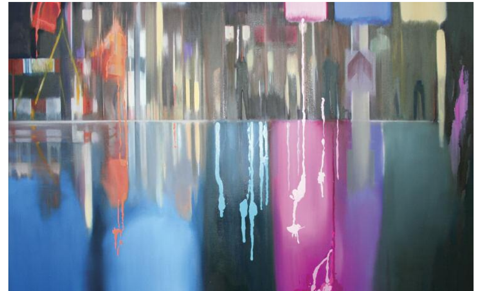
Euston