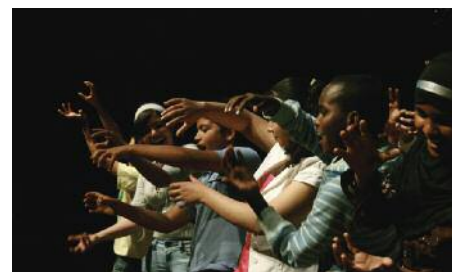
Minding the Gap workshop

The Social Inclusion Programme provides a variety of activities both at the Tricycle and off-site in the borough throughout the year. The programme works with marginalised young people aged 6-18 who are either excluded or at risk of social exclusion through migration, special needs, behaviour issues or isolation. Trained facilitators use visual and performing arts as a way to engage with these young people, to boost self-confidence and self-esteem, to develop creativity and self-expression, to encourage teambuilding and to foster integration. Last year, the Social Inclusion Programme had attendances of almost 15,000.