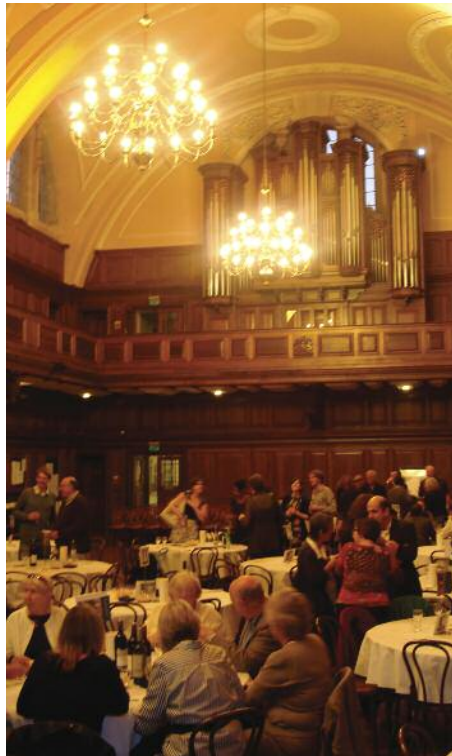
The annual Quiz

The annual Quiz, a Wine Tasting and Festive Fair and the major fundraising event of the year at the Bloomsbury Ballroom were organised by the Development Committee, supported by the Development Department and together raised nearly £85,000. In addition a variety of post-screening Q&As in the Cinema raised a further £5,600. A special Art Auction also took place at the Portland Gallery. The Development Committee's enthusiasm, resourcefulness and commitment ensured the success of the Tricycle's events in this financial year.