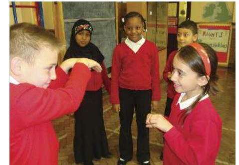
Literacy through Drama

Programme: John S Cohen Foundation Garrick Charitable Trust Foresters Friendly Society Robert Gavron Charitable Trust Harold Hyam Wingate Foundation Help a London Child John Lyon's Charity Jack Petchey Foundation Stanley Foundation Sir Siegmund Warburg's Voluntary Settlement Sobell Foundation Unity Theatre Trust Vandervell Foundation