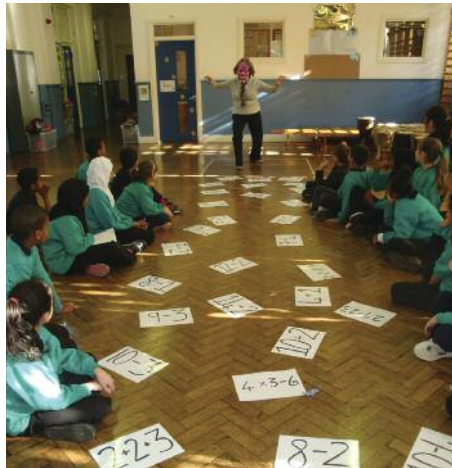
Numeracy through Drama session

Most activities were free to participants.