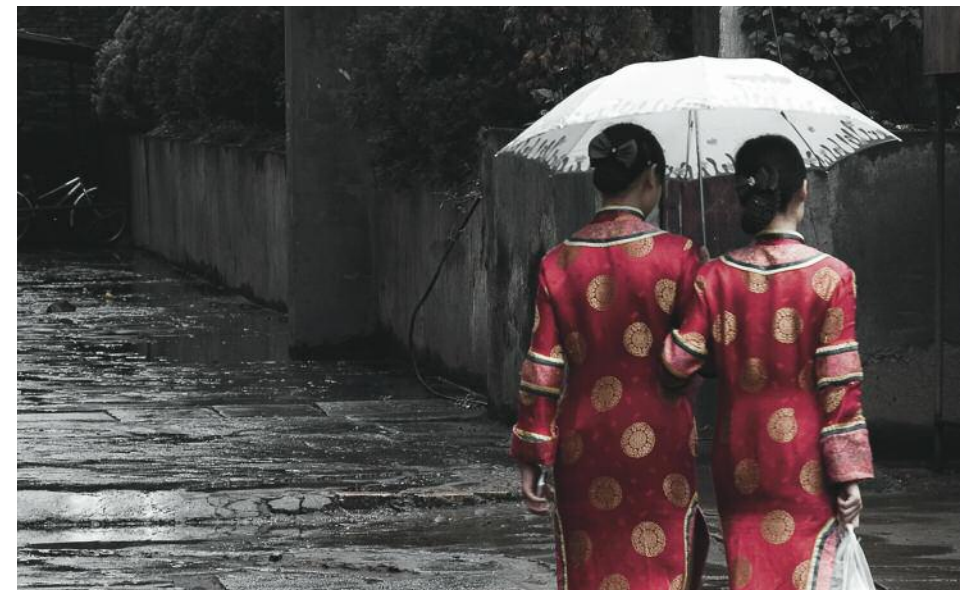
Detail from photograph by Dawn Bowery